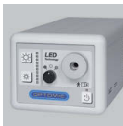
FIBROLUX LED LIGHT SOURCE