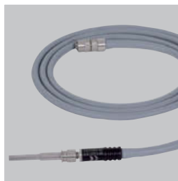
FIBER OPTIC CABLE