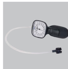
LEAKAGE TEST DEVICE