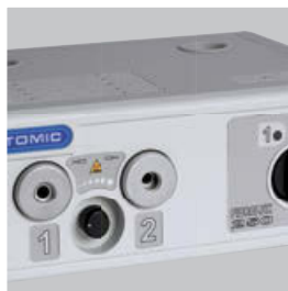
FIBROLUX 250 LIGHT SOURCE