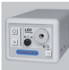
FIBROLUX LED LIGHT SOURCE